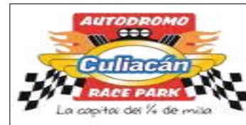
AUTODROMO CULIACAN RACE PARK Culiacan, Sinaloa