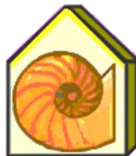
IMPORTACIONES Y EXPORTACIONES NOBARO S.A. DE C.V. (Mexico)