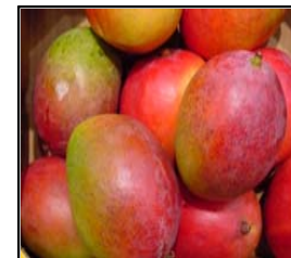
MEGA EMPACADORA DE FRUTAS S.A. DE C.V. R.F.C. MEF9603051L4 (Mexico)