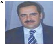
Hector BELTRAN LEYVA DOB: 1 Jan 1960 POB: Mexico