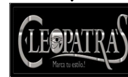
J & S. DE R.L. DE C.V. (a.k.a. CLEOPATRA'S) San Pedro Sula; La Cieba; Santa Rosa de Copan (Honduras)