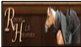
RANCHO LA HERRADURA Laguna de Ticamaya (Honduras)