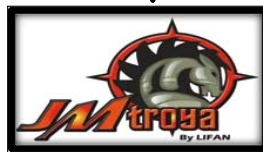
JM TROYA San Pedro Sula (Honduras)