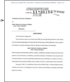
Southern District of Florida March 3, 2011 Indictment