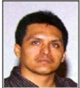
Miguel TREVINO MORALES Leader of LOS ZETAS cartel

The President identified the SINALOA CARTEL and LOS ZETAS as Significant Foreign Narcotics Traffickers pursuant to the Kingpin Act.