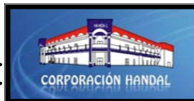
CORPORACION HANDAL San Pedro Sula (Honduras)