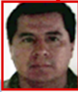
Raul Sabori Cisneros Caborca Plaza