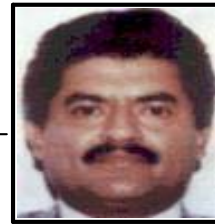
Juan Jose ESPARRAGOZA MORENO (a.k.a. "El Azul")

Previously-designated individuals & entities appear in black text.