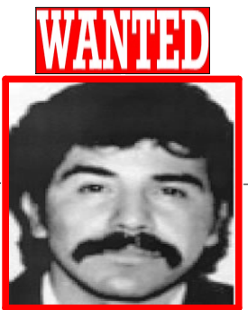
Rafael CARO QUINTERO

Fugitive from U.S. Justice; Released from Mexican Prison on August 9, 2013