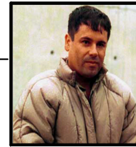
Joaquin "Chapo" GUZMAN LOERA

The President identified Joaquin GUZMAN LOERA on June 1, 2001 pursuant to the Foreign Narcotics Kingpin Designation Act