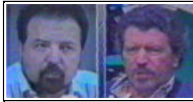
**Gilberto Rodriguez Orejuela **Miguel Rodriguez Orejuela

Department of the Treasury Office of Foreign Assets Control