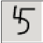
ADMINISTRADORA GANADERA EL 45 LTDA. Medellin, Colombia NIT# 811038291-3