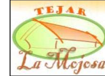
TEJAR LA MOJOSA S.A. Caceres, Antioquia, Colombia Caucasia, Antioquia, Colombia NIT# 900110438-9