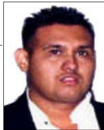
Omar TREVINO MORALES DOB 01/26/1974 Designated by OFAC as a Kingpin in March 2010

Mexico's Office of the Attorney General is offering nearly $2.25 million for information leading to his arrest