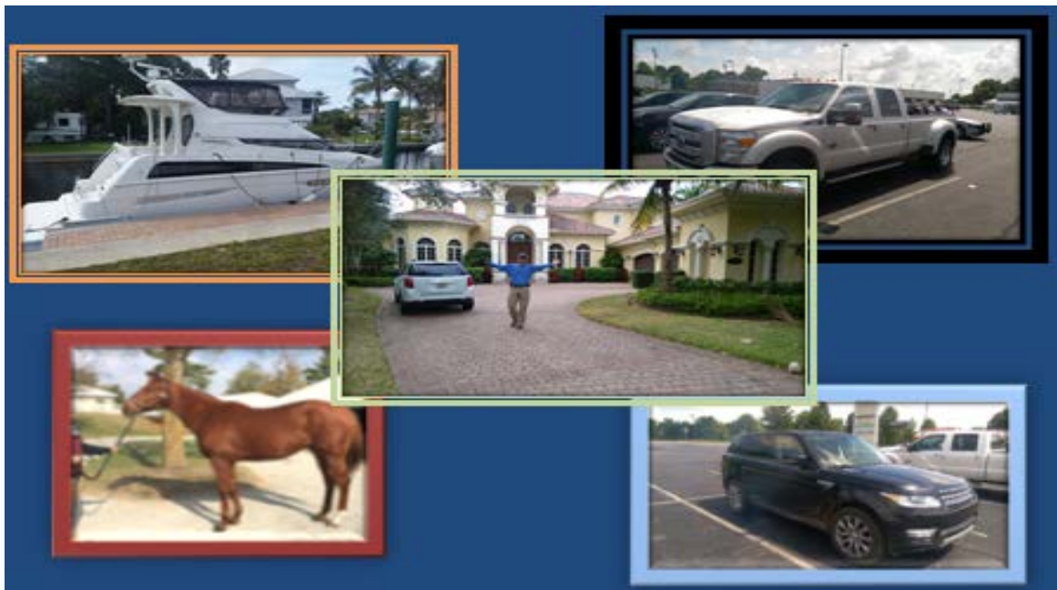
Figure 5: Defendant's property, including a '43 yacht, F-450 truck, race horse, Range Rover, and a luxury villa.

On April 14th, 2015, multiple simultaneous search and seizure warrants were conducted at facilities and residences located in Florida, Washington, and Georgia. USSS seized monetary instruments totaling $1,955,392.53, as well as a number of luxury items, including: two real properties located in Florida valued at $2,505,500; four horses, four personal vehicles, 264 gold coins, and a 43-foot water vessel.