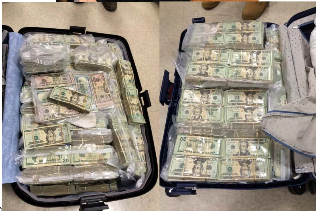
Figure 2: $1,780,801 in bulk cash packed in three pieces of luggage, which was seized from two couriers.