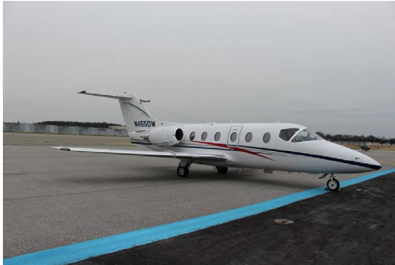
Figure 4: The Beech Jet 400 utilized by the MLO.