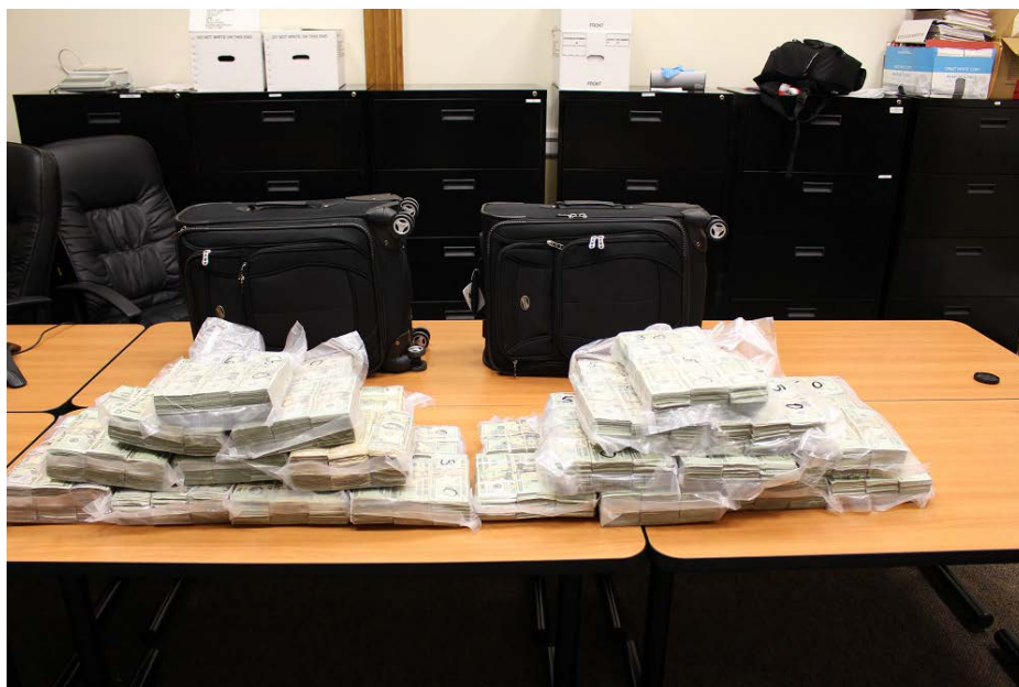
Figure 3: Bulk currency amounting to $1,039,205, which was secreted in luggage aboard the aircraft.

Both the currency and the airplane were seized. The currency was forfeited on November 30th, 2016. A civil lawsuit, motioning for the return of property, has been filed for the Beech Jet 400. Forfeiture of the aircraft depends on the outcome of the lawsuit.