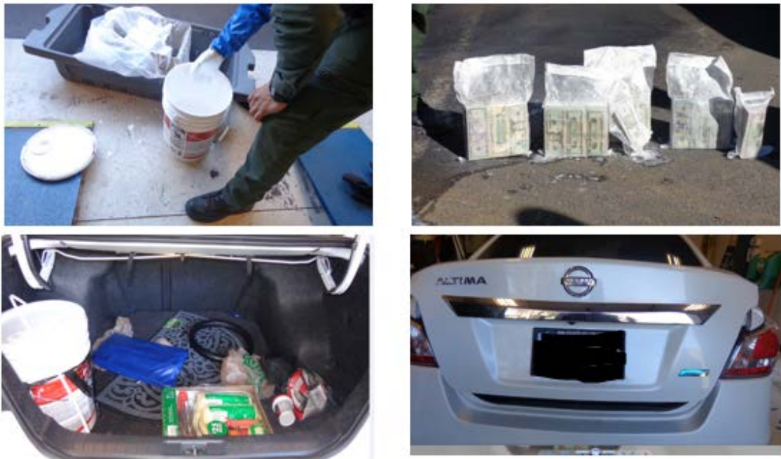
Figure 1: Top Left: the plastic bucket used to hide the cash; Top Right: $290,030 in bulk cash; Lower Left: the trunk encountered by CBP officers; Lower Right: the vehicle used to smuggle the cash.

The driver provided the agent with inconsistent statements about his journey and was shaking uncontrollably. Upon gaining consent to search the vehicle from its driver, the agent's canine partner alerted to a plastic paint bucket contained within the trunk. It was discovered that the bucket contained $290,030. The driver of the vehicle was taken into custody and charged with bulk cash smuggling. After removing a counterfeit $100 bill, the remaining $289,930 was forfeited on May 11, 2017.